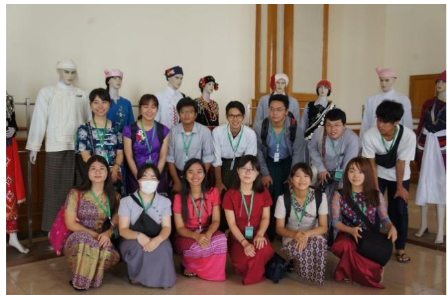
Visiting the House of Nationalities