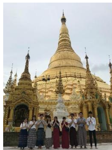
Visiting the Shwedagon Pagoda