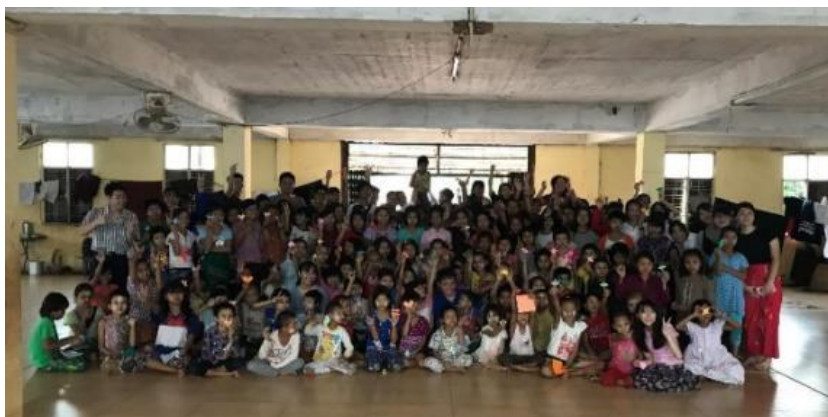
Visiting an orphanage