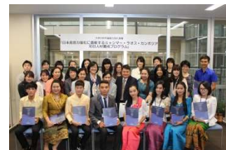
Students from National University of Laos and Royal University of Phnom Penh (Closing ceremony of Short-term Joint Education Program)