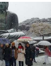
Students from University of Yangon (Short-term Joint Education Program Experience-based study of Japanese culture (in Kamakura))