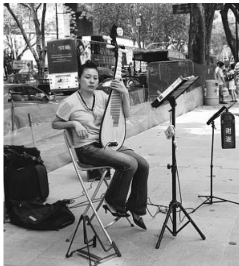
Figure 3: A Chinese pipa player performing outside Ngee Ann City Shopping Centre