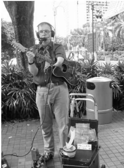
Figure 6: A handicapped busker performing outside Ion Orchard

and Butler 1999). Recognising this, this paper argues that disabled buskers, on top of other resistances they face, go further to challenge stereotypical notions. The power they put across is that they are as qualified as abled members of society and that their lives are even more meaningful through art. Through evoking sympathy and awe, the position of the marginalised disabled person is improved, at least superficially. Empowerment through performance also helps them assert themselves in a landscape of dominant culture. Their presence and power shape the societal landscape, thereby increasing awareness of minority groups in Singapore.