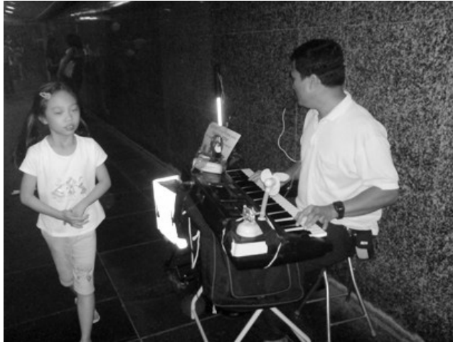
Figure 4: A visually impaired busker who is often spotted along the underpass leading to Orchard Mass Rapid Transit (MRT) station.