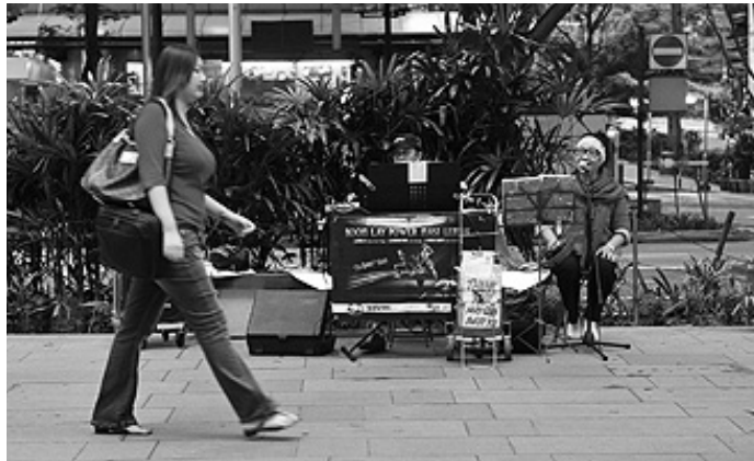
Figure 2: Veteran couple 'The Highlights' busking along Orchard Road