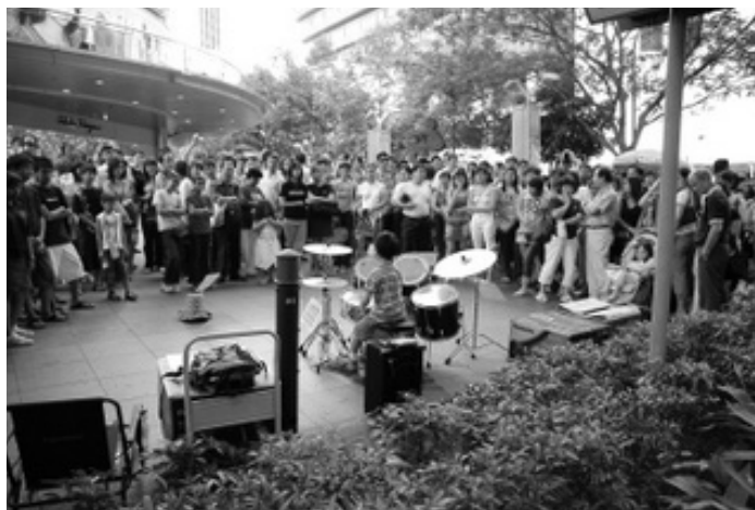
Figure 1: Ethan Ong performing for a group of audience outside The Paragon shopping mall

Despite these, tensions that may arise from contestation of performing space between busking groups do not faze them due to an unspoken etiquette whereby different groups respect the space and performance times of others (Sunday Times March 22 2009). While it is too soon to judge the effects of the new legislation, buskers are aware of their place as colourful additions to an otherwise sanitised Orchard landscape. Each individual performance site is an alternative enclave. Collectively, by virtue of bearing a little bit of humanity in their acts, the buskers transform the Orchard landscape culturally and “such colour is anything but an eyesore” (The Online Citizen). From 9 year old drummer Ethan Ong (Figure 1), to veteran couple ‘The Highlights’ (Figure 2), to a pipa player from China (Figure 3), to a visually impaired keyboard player, a city that embraces diversity is encapsulated by the multifarious streetscape.