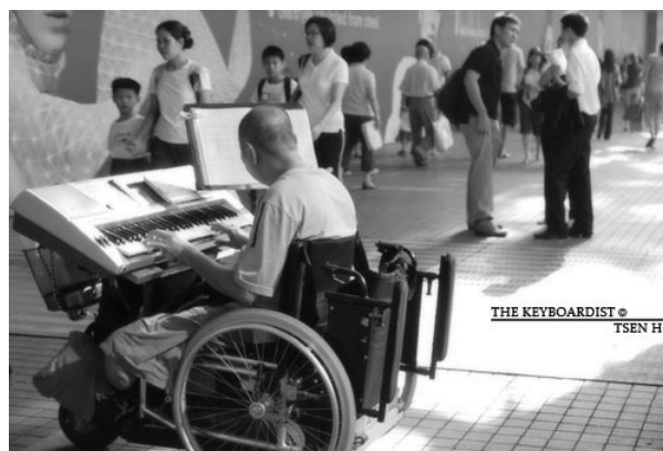
Figure 7: Another handicapped busker performing outside Ion Orchard