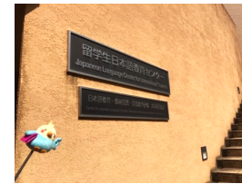
Japanese Language Center