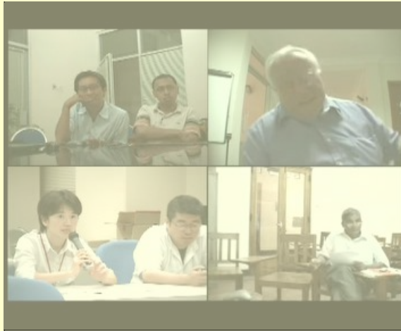
Image of multi-point connection